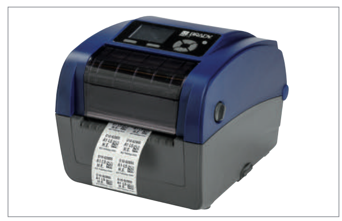
Step 3: Print