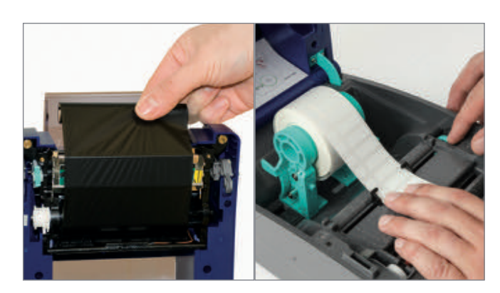
Step 1: Insert media